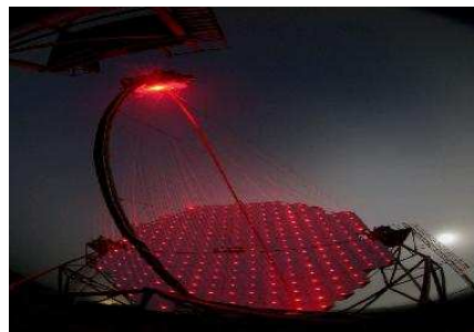
Figure 1: MAGIC telescope with all AMC guidance lasers switched on.

These panels are attached to the carbon fiber support frame at three points; one of these points has a fixed distance, while the other two are equipped with longitudinally movable actuators having a lateral freedom of one and two dimensions respectively. Each actuator contains a two phase stepping motor and a ball-bearing-spindle, allowing to move the panels with a precision < 20 \mu\text{m} , corresponding to a displacement of the light spot at the camera of less than 1 mm. To monitor the orientation of a panel, each one is equipped with a guidance laser module, pre-adjusted to point to the target of the panels (figure 1).