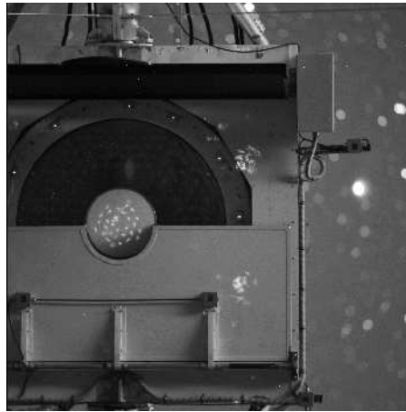
Figure 3: Light-spots of 30 mirror tiles defocused to a pre-calculated pattern on a reflector at the center of the PMT camera.

To overcome this restriction, the CCD-camera was upgraded to higher sensitivity to be able to see the reflection of a single panel while tracking a bright star. Additionally, a mechanism to position a highly reflective panel in front of the PMT camera was installed. By completely defocusing all but one panel, it is therefore possible to find the best alignment. But since this procedure needs several hours and the stars visible under small zenith angles move rather fast and have to be tracked by the telescope, this does not result in a focusing for one fixed zenith angle. Therefore, a method was developed to defocus about 30 panels according to a pre-calculated grid arrangement (and completely defocus the remaining \approx 210 panels) as shown in figure 3. As long as the displacement of the light spot of a panel is less than \approx 3 cm, it can be identified and a correction be calculated and applied. Since this needs only 8 measurements to control the alignment of the 247 panels it can be completed in few minutes and the movement of the telescope can be neglected.